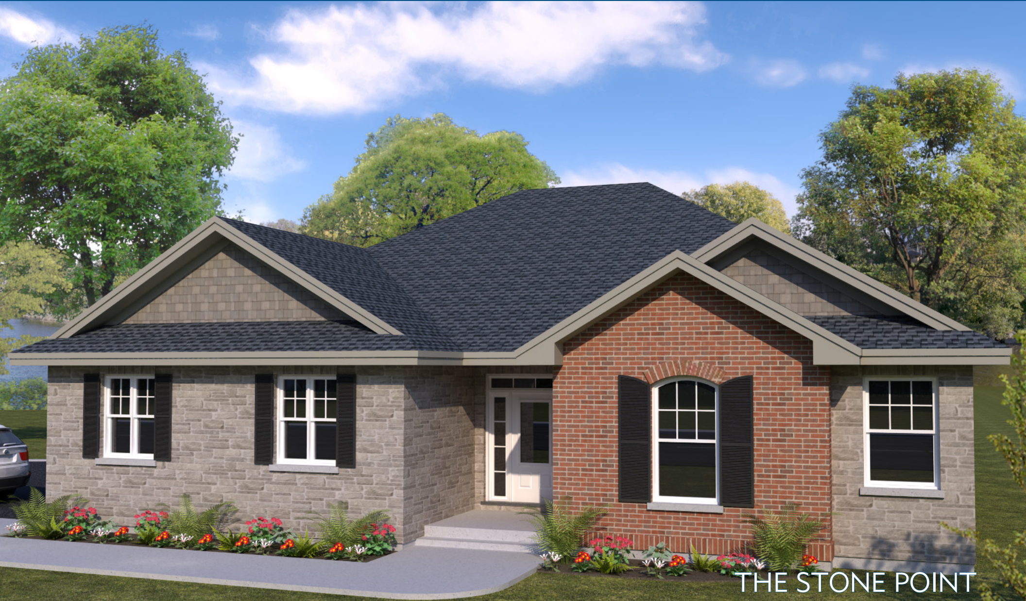
THE STONE POINT